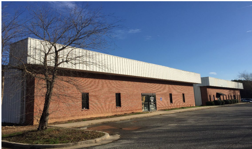
Property Profile: Buildings 110 & 116

For more information please contact: James Clark 770-652-1844