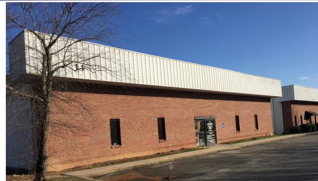
Property Profile- Building 110

For more information please contact: James Clark 770-652-1844