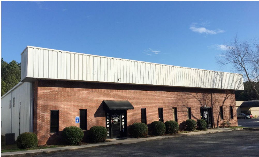
Property Profile- Building 116

For more information please contact: James Clark 770-652-1844